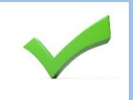
Photo identification, Social Security/ITIN number, W2's/1099s, proof of insurance, bank interest statements, IRS letters and any other tax documents.